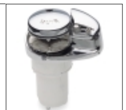
Muir Atlantic 850 Inline