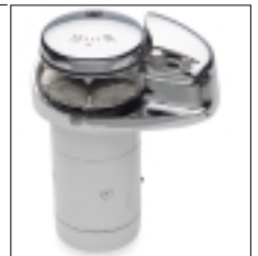
Muir Atlantic 1250 Inline