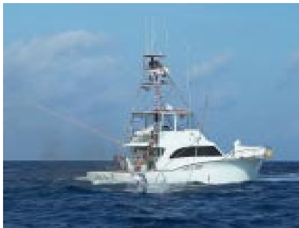
The Reel Chase.

For information about fishing onboard the Reel Chase, visit www.reelchase.com