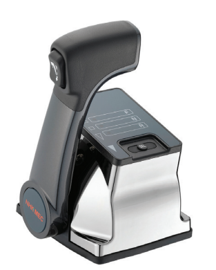
Control Head (single with PTT SW) NM1001-00