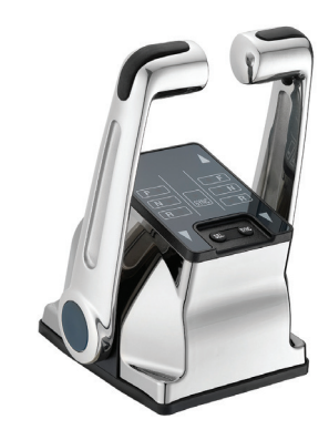
Control Head (dual, stainless steel levers) NM1053-00