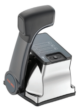
Control Head (single without PTT SW) NM1002-00