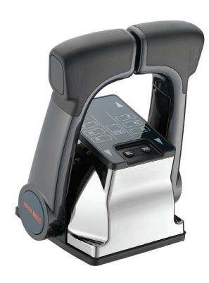
Control Head (dual without PTT SW) NM1052-00