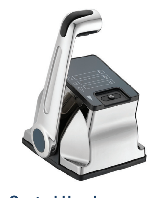
Control Head (single, stainless steel lever) NM1003-00