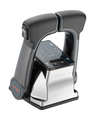
Control Head (dual with PTT SW) NM1051-00