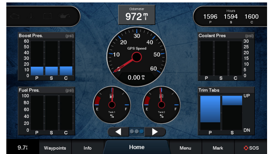
Trim tab position can be displayed on capable MFD's